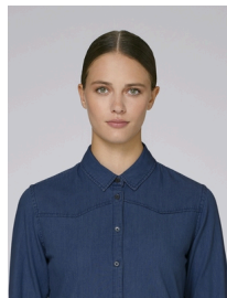
Stella Inspires Denim

Printing Specifications Wash and dry separately. Do not iron on print, wash and iron inside out. This garment is made of 100% cotton. Each website may vary in appearance. Denim washed effect will become stronger over time. Colour may transfer by rubbing onto light coloured materials. Use mild detergent which contains no bleach.