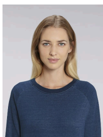
Stella Tripster Denim