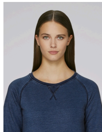
Stella Trips Denim